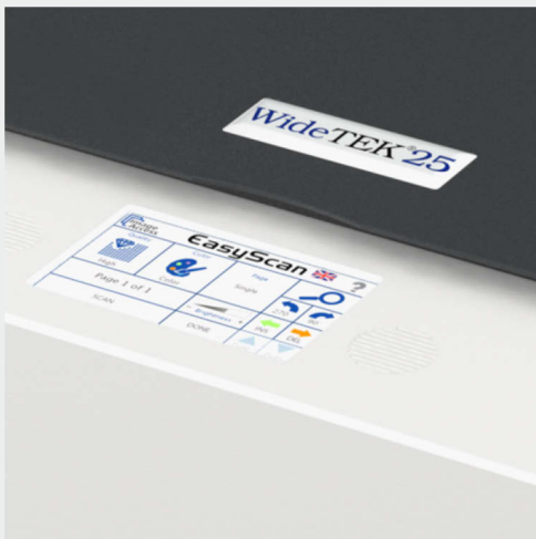
Large color touchscreen for simplified operation