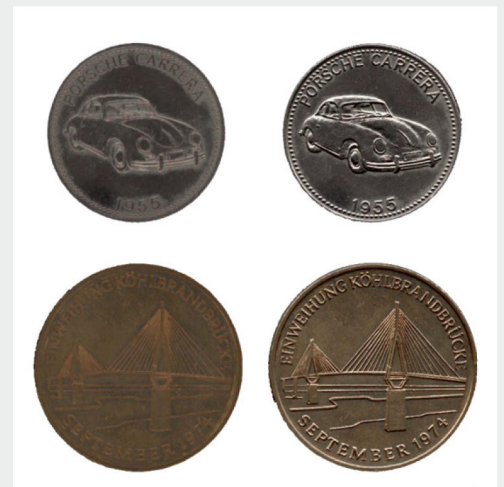
2D scan versus 3D scan, capture all details